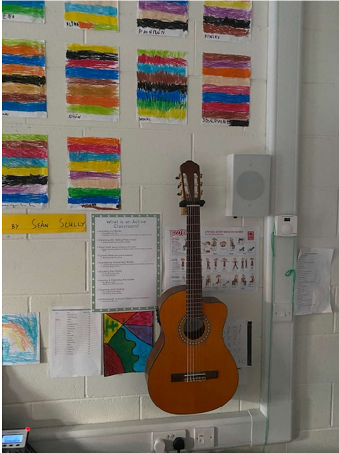
There's always music in Junior Infants