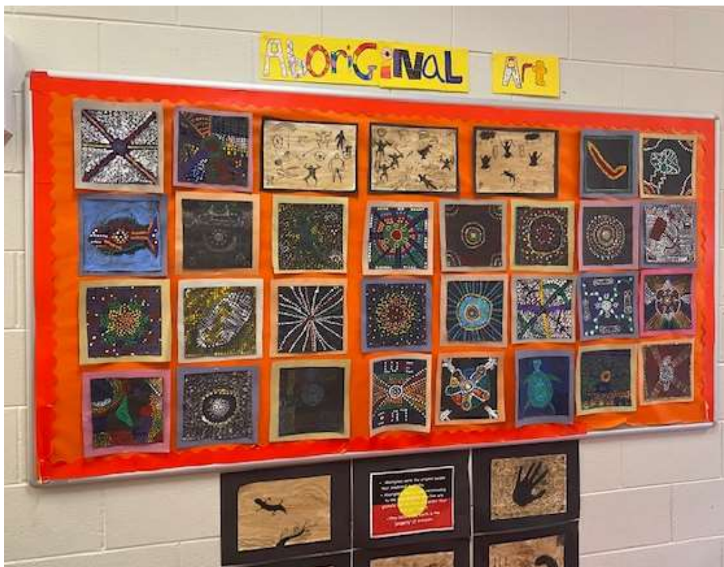
Aboriginal Art in 6th Class