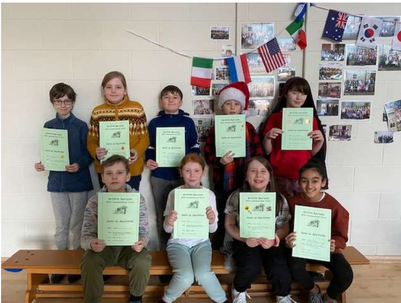
Well done to this week's Students of the Week