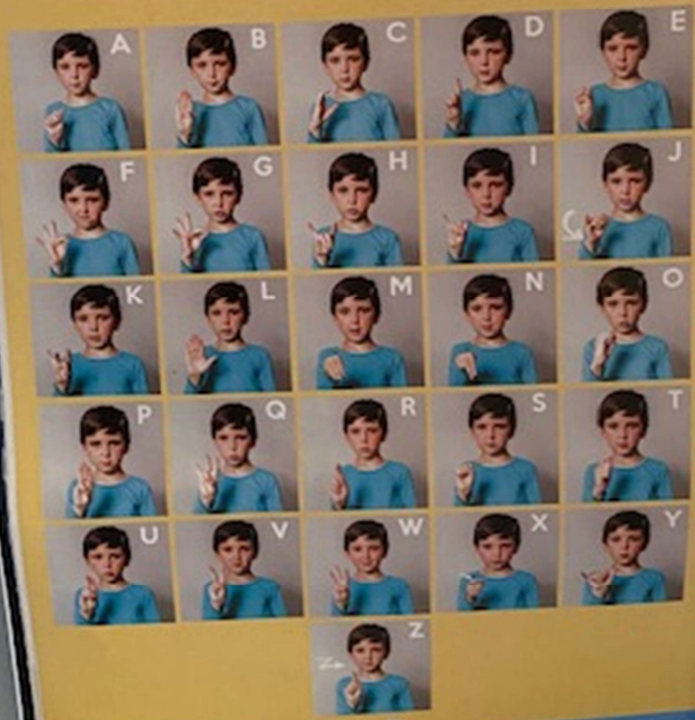
Irish Sign Language in action in GBMDS

This is the Irish sign Language manual alphabet