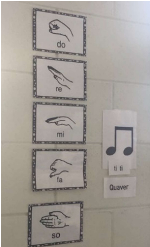
Figure 3 Music Learning Solfa notation in Rang 5