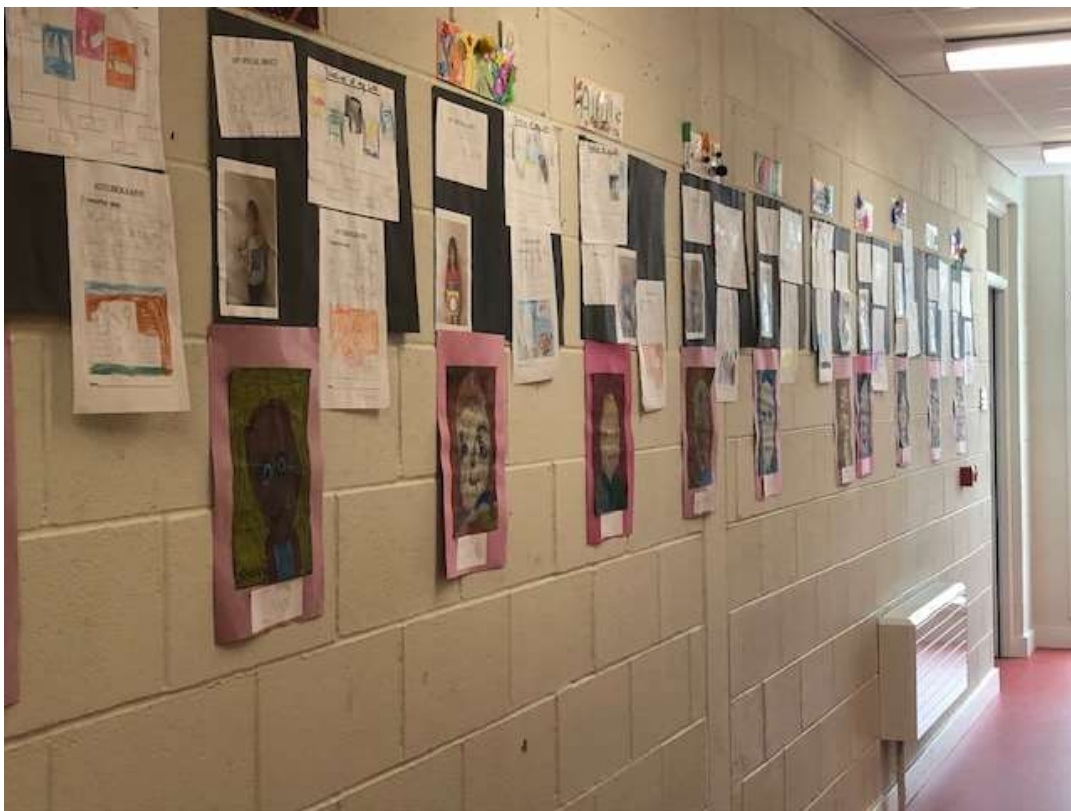
Figure 1 Our personal timelines in Rang 1