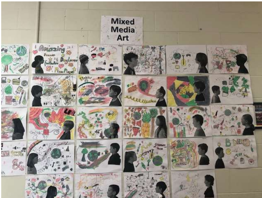
Figure 2 Mixed Media Art in Rang 6