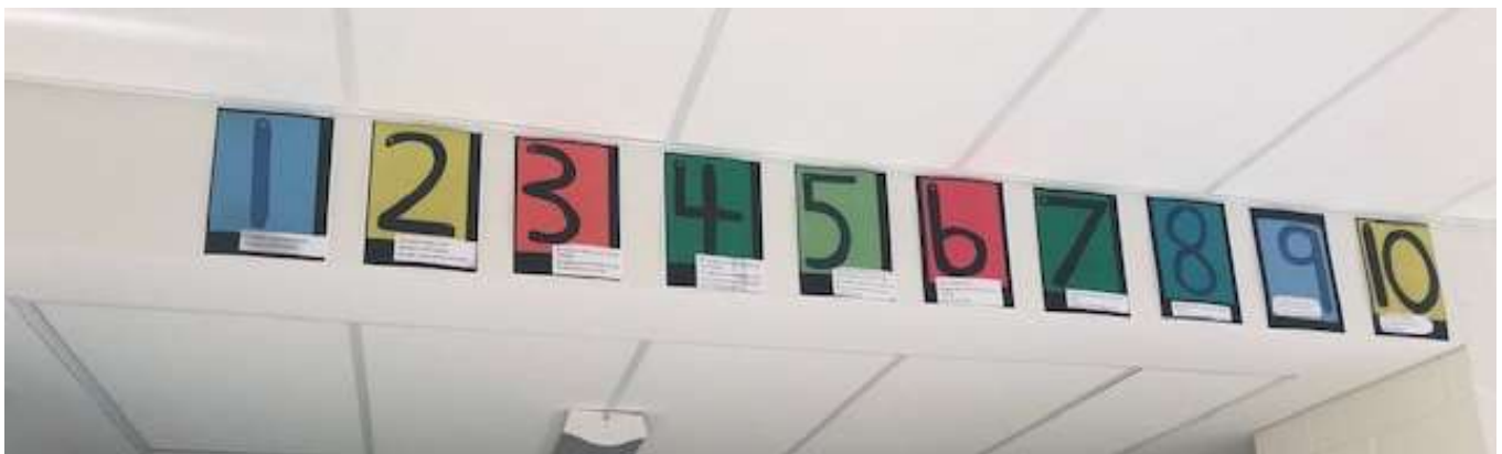
Learning to write our numbers in JI Cian