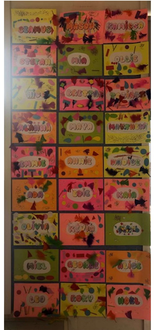
Our names are so important in Junior Infants