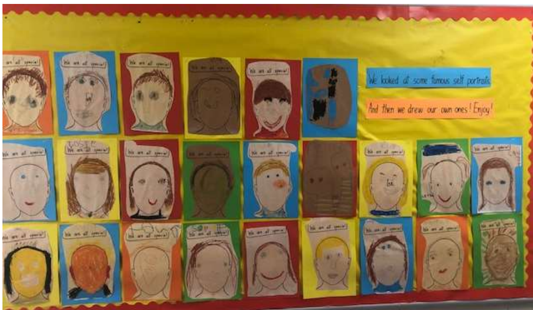
Amazing Self-portraits from Senior Infants