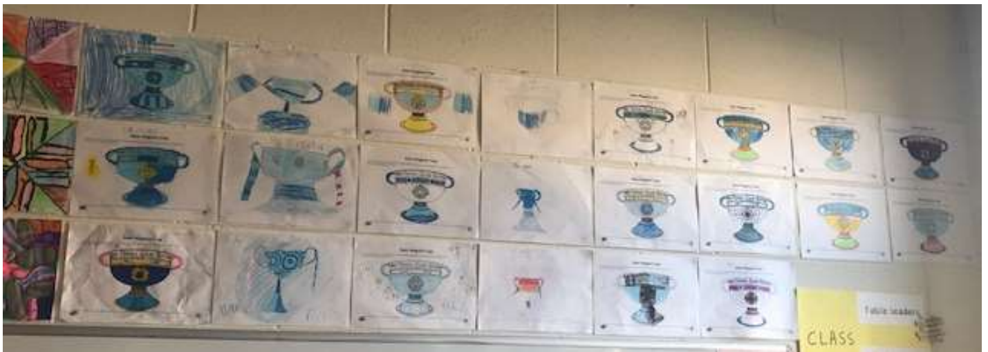
What a weekend for Dublin football celebrated by Rang 2 Anita