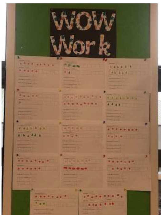
Figure 3 Figure 2 WOW work is work to be proud of in Rang 1 Anne Marie