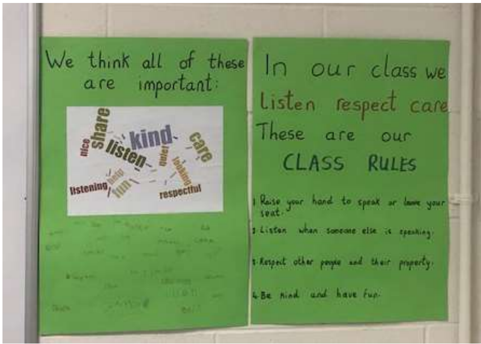
Figure 5 We draw up our class rules together at GBMDS