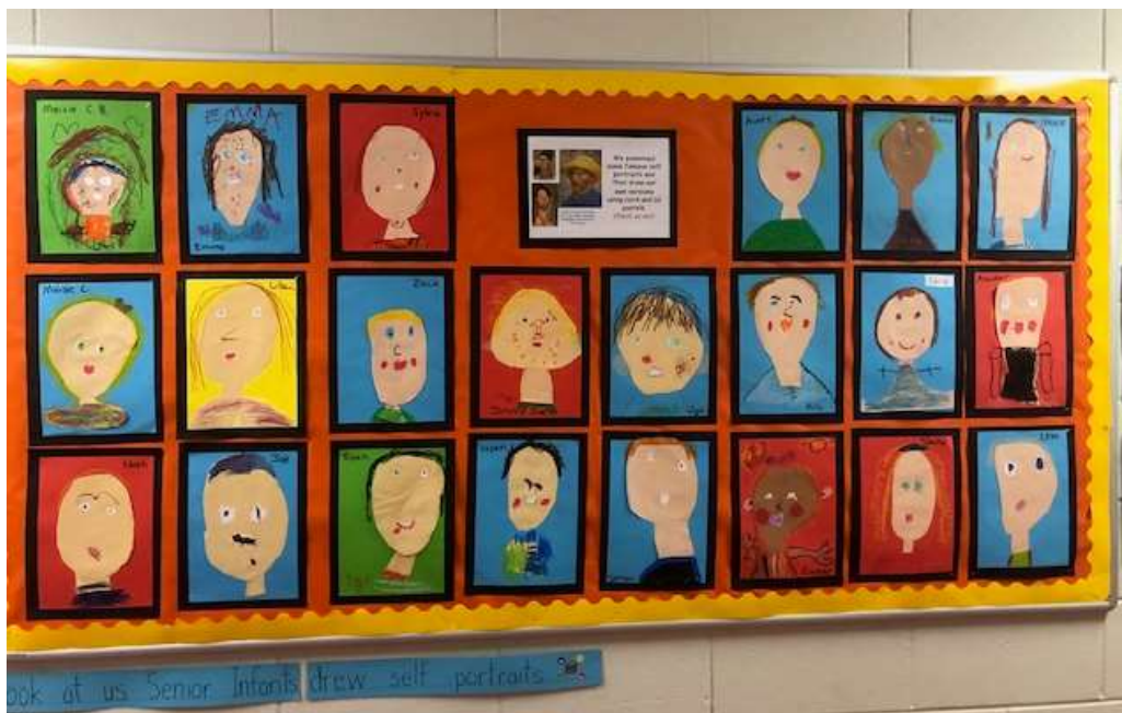
Figure 1 Van Gogh inspired paintings in Senior Infants Ruth