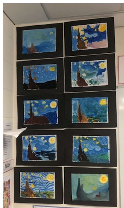
Figure 2 Figure 4 Art makes its way into all subjects