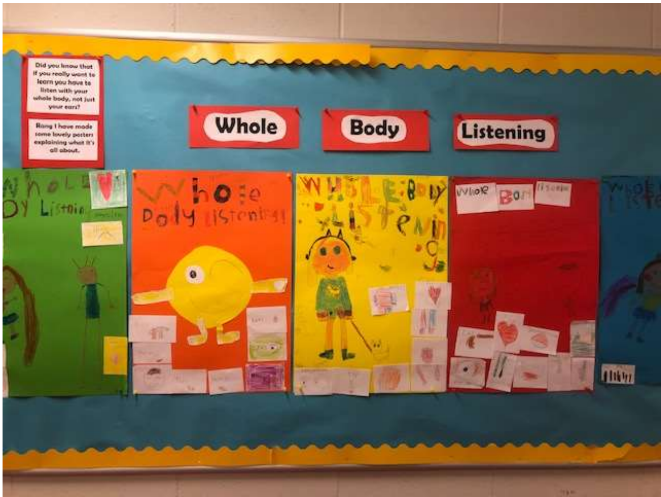
Figure 4 Whole body listening helps us to be great listeners