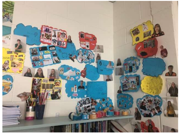
6th class show us who they are in words and pictures