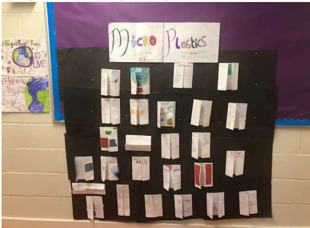
5th Class have been learning about Micro plastics