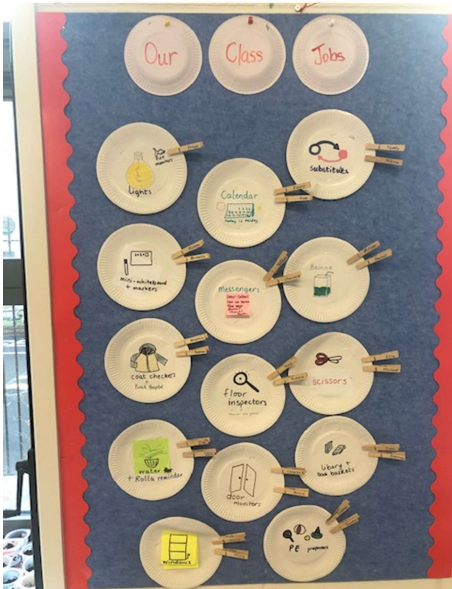
Everyone has a job in this class #collectiveresponsibility