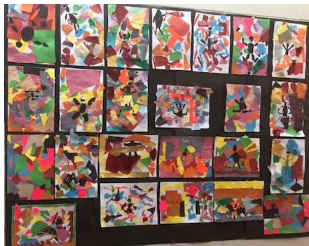
4th Class are learning about the artist 'Matisse'