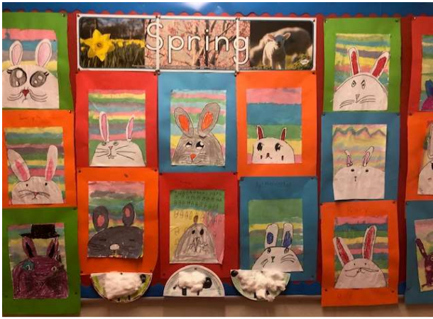
Spring has come to Rang 1 Aisling