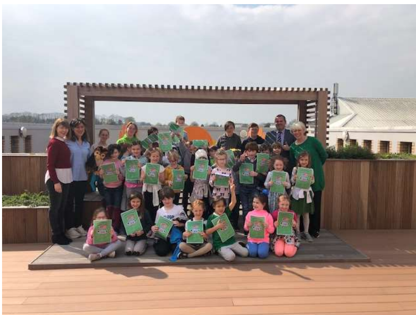
Figure 3 1st Class graduated from Fun Friends Resilience Programme this week