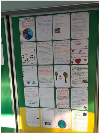
Figure 1 Great ethics wall in Rang 4