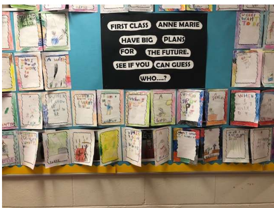
Figure 2 When I grow up? in Rang 1 Anne Marie