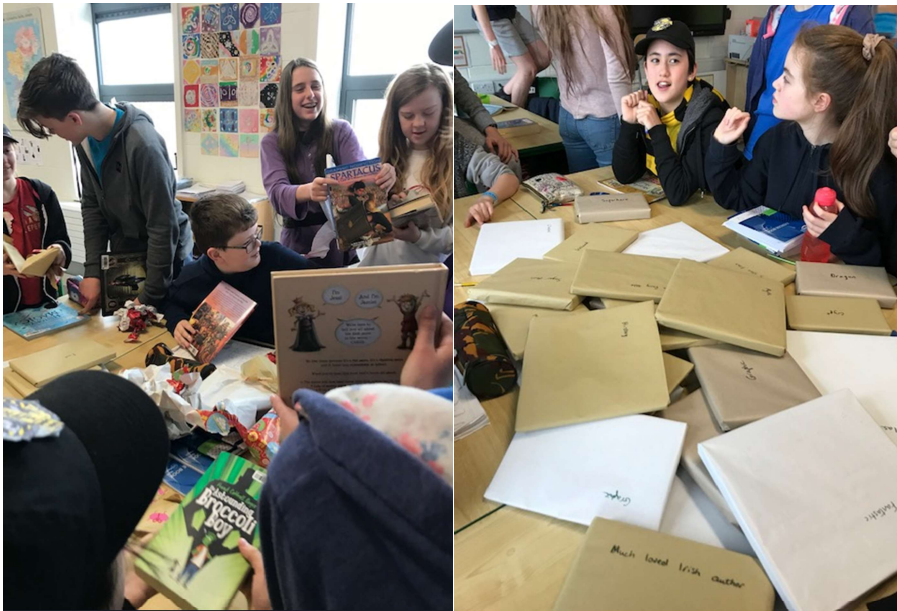
6th Class learned that you can't judge a book by the cover