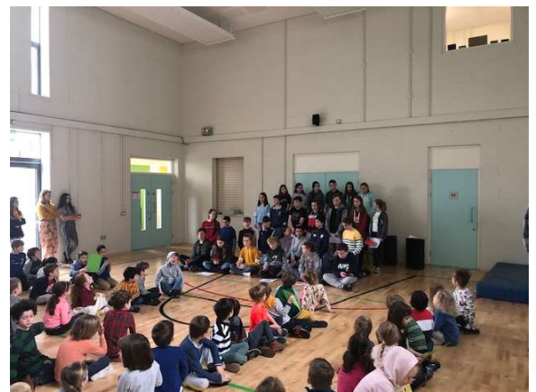
A great Presentation on Buddhism at Assembly