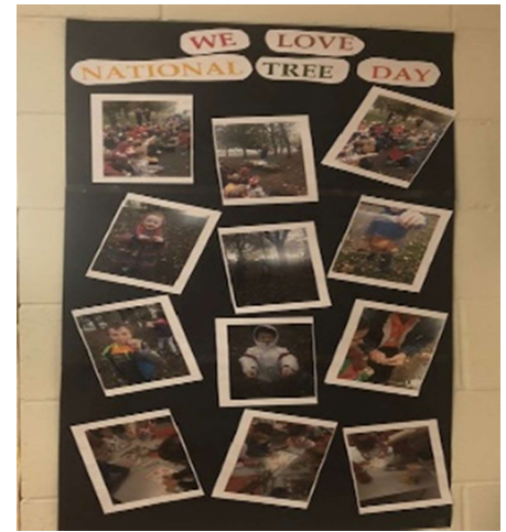
Figure 1 Some wonderful memories of Tree Day outside Rang 1