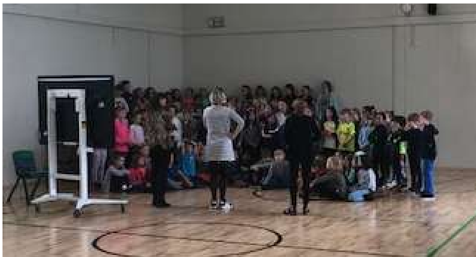
Choir having 1st rehearsal for Peace Proms